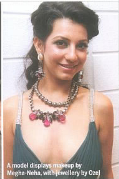
A model displays makeup by Megha-Neha, with jewellery by Ozel